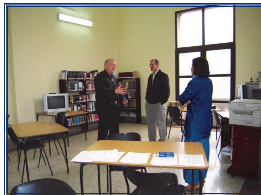
Methodist library in Cuba

Consequently we are increasingly recognizing that the development of theological libraries is vital to the fulfillment of our mission. We have found it very encouraging to work with a number of senior librarians who have agreed to generously offer their expertise, advice and encouragement to the leadership and especially the librarians of our partner schools. And we are giving particular focus to the libraries and theological resources of our partner schools in two countries: Vietnam and Cuba.