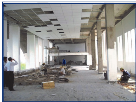
Library at the Institute of Bible and Theology (IBT) in Vietnam