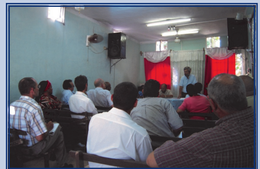
Pastors, lay leaders and denominational officials at the consultation in Holguin

Next steps include identifying a core group of individuals who could serve as an organizing committee, along with that person who could serve as the key or central person to provide administrative oversight as a new academic program is launched. The involvement of reSource will be two-fold: expert counsel on the formation of a theological program and also the seed funding for the start up, which will take at least three years. This is a very clear example of where a program in theological education simply cannot be launched without external support, including financial support.