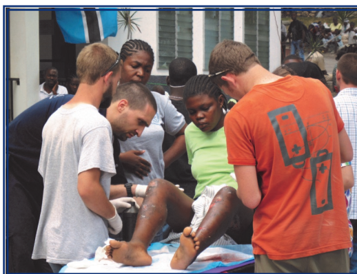
Medical clinics have been set up in front of the Underwood building with classroom tables being used for consultations and treatment. Seminary students and staff have helped as aids and with translation.