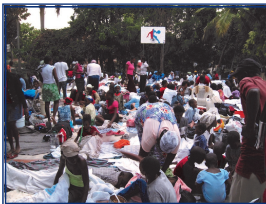
Every flat bare space is now covered with bedsheets, sheets, tents and people. One of STEP's first censuses counted 1,500 children and 2,500 youth and adults.