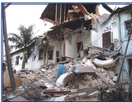
This is the front middle section of the Administration building with all the damage. The rubble comes up to the top of the ground floor, so in this photo, the second floor and attic are visible. There were three classrooms and nine offices on the ground floor.