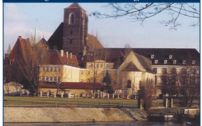
Evangelical School of Theology, Wrocław

had previously worked together under Communism, and now began a Bible school in the church with a small group of students. They had no library other than their own personal books.