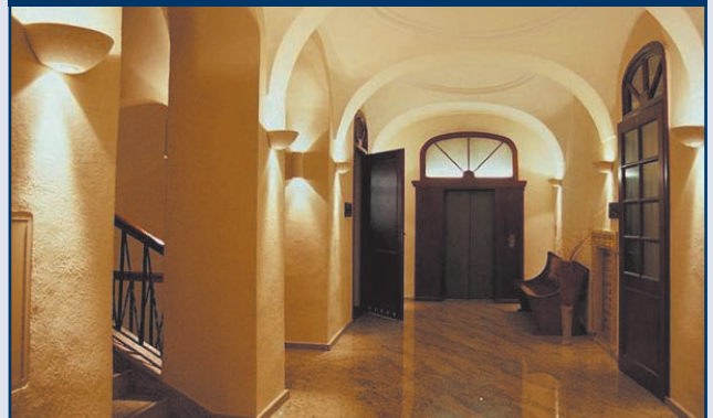
The renovated 18th century building

Today the school is a fully accredited institution, and is included in a list of schools of higher education in Poland. It is the first accredited, non-public, theological vocational school in the country. It presently has around 80 students and 20 faculty, is situated in a spectacular building in the best location in town, and the library contains 18,310 volumes and subscribes to 25 theological journals.