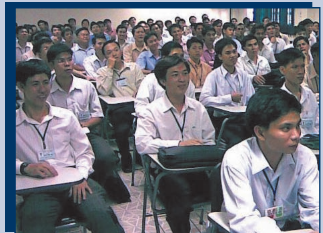
Students at the Institute for Bible and Theology (IBT) in Ho Chi Minh City